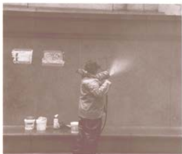
National Park Service

Protective coatings are generally applied to masonry surfaces with spray equipment. This allows for better penetration into the building material ensuring effective and long-lasting product performance. Since the application of protective coatings should be considered carefully, it is best to consult an experienced and knowledgeable architect, building conservator, or contractor.