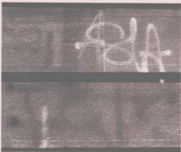
Removal attempts often leave ghost images of graffiti. A ghost image remains on the bottom stone panel.

Identifying the vandalized building material is important. Common building materials easily damaged by graffiti are masonry, metal, glass, and wood. It is easier to remove graffiti from non-porous materials such as metal and glass than from porous materials such as brick, concrete, limestone, and brownstone. Materials such as glass and metal, often adjacent to areas being cleaned, should be protected to avoid damage. It is equally important to identify the graffiti-marking material. The most widely-used materials are spray paints and felt-tip markers.