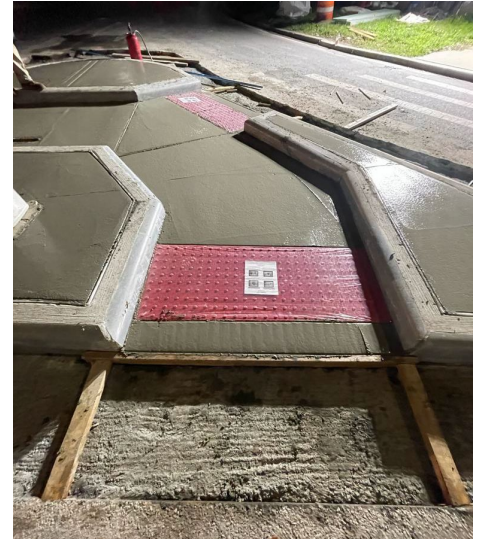
New concrete placed at the Columbia Street island with ADA compliant cross walks