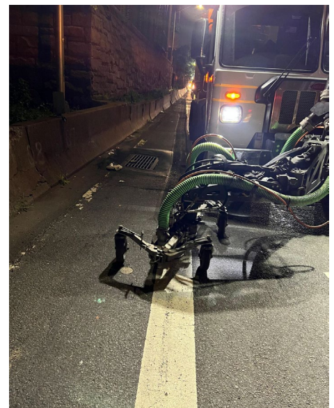
Removal of existing striping

Both formats of the June presentation are available on the NYCDOT website: bit.ly/bqeinterimrepairs