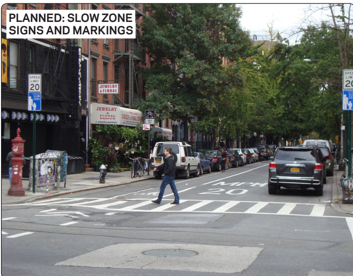
PLANNED: SLOW ZONE SIGNS AND MARKINGS