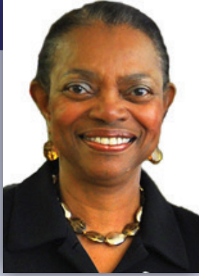
Senator Velmanette Montgomery